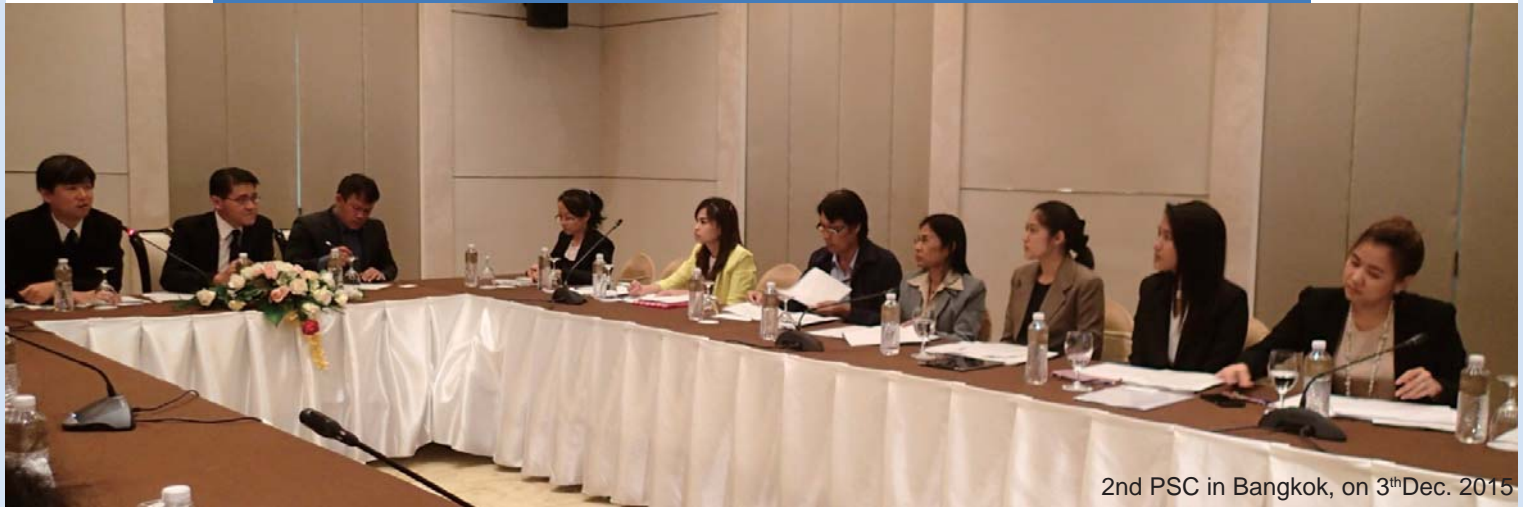
2nd PSC in Bangkok, on 3 rd Dec. 2015