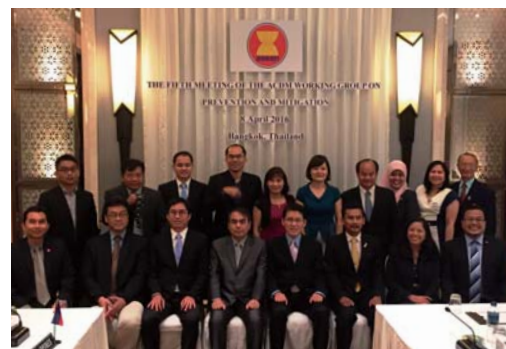
↑ Photo Session of 5th ACDM WG